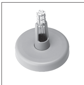
LED-light: Diameter 87 mm Height 89 mm

Do It yourself LED-light to convert a wired table lamp to wireless. Suitable on a table, sideboard or TV-bench. Get a fantastic look with the ugly lamp cable gone!