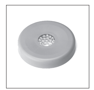
LED-light : Diameter 87 mm Height 16 mm

Wireless powered LED-spotlights in display cabinets, bookshelves, or kitchen cabinets. Get a stylish look hiding away ugly cables completely.